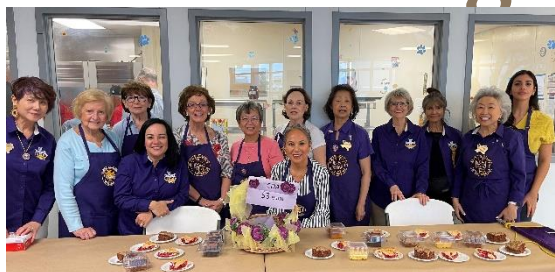
Bake Sale 2023 & New Members