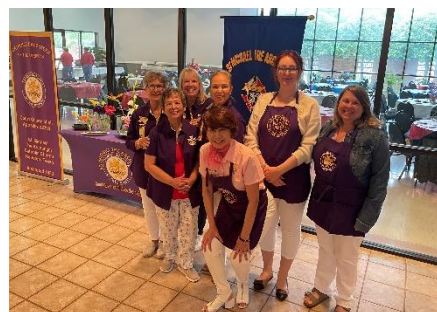
Bingo Game & Helpers